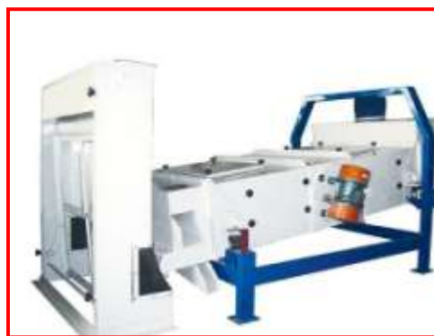
Figure 2.1: Paddy cleaner